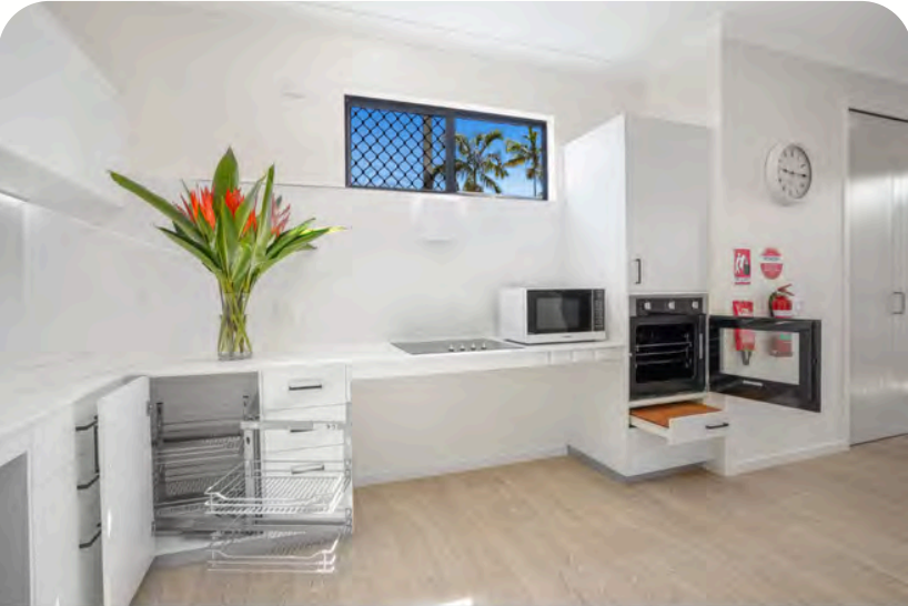
30 Lily Street, Cairns North QLD 4870 High Physical Support VILLA 1