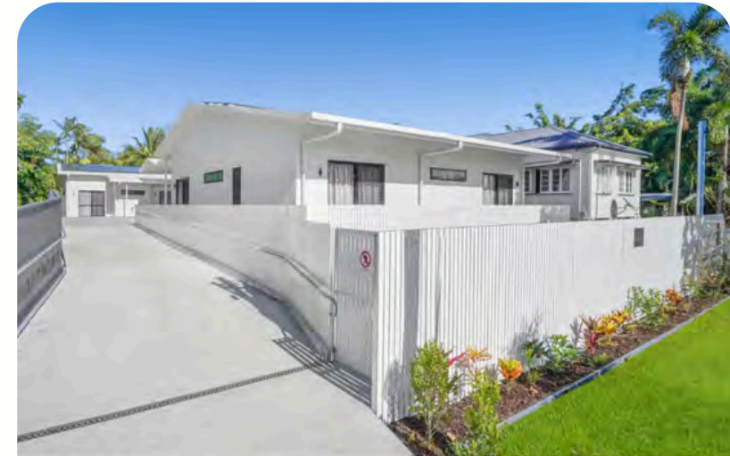
357-359 Severin Street, Parramatta Park QLD 4870 High Physical Support HOME 2